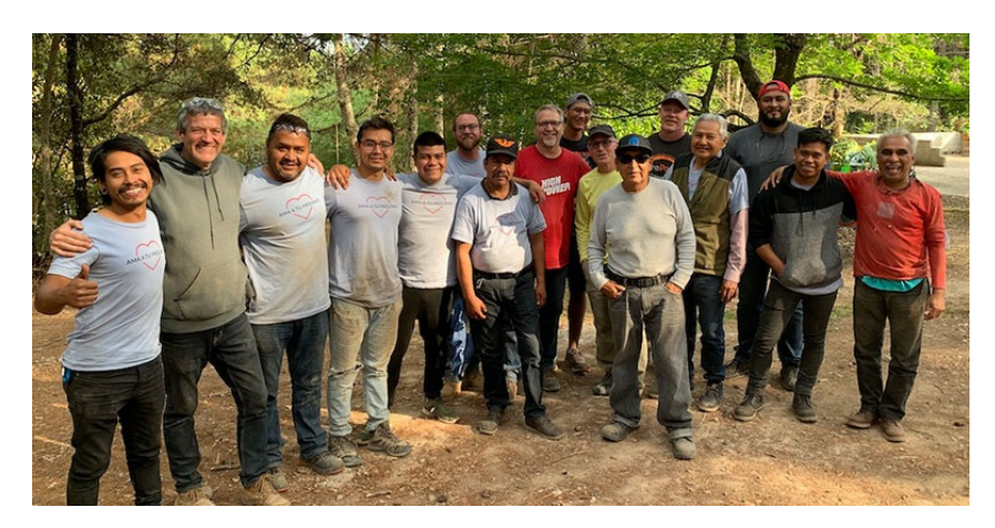
God's presence was felt and at times we experienced the touch of His healing hand. One of the participants was suffering greatly and couldn't eat or sleep. By the time he left he was feeling better, eating and sleeping again. Praise God!