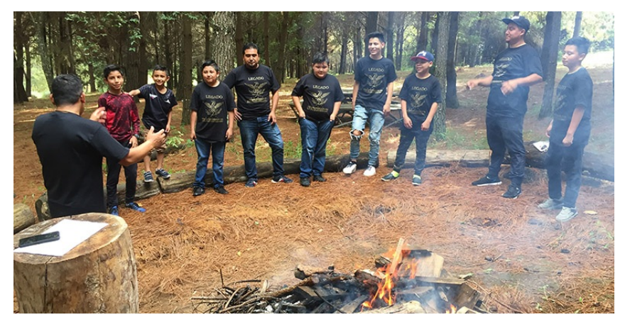
When people are forced to slow down and turn back to God, He shows up willingly, ready to help us in our time of need. Several of our friends and their families have experienced the virus in their lives but we thank God for their recovery and for the testimony of His intervention in their lives.