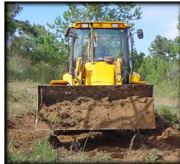
Digging foundations in Loma

It took two days to dig the driveways and the eight dome foundations that the Caldwells are putting onto their land in Loma.